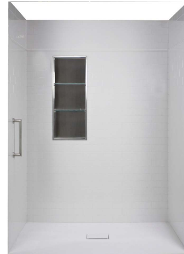
Modern low profile design with a slate look slip resistant texture.

Notes: Install this product according to the installation instructions.