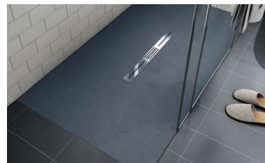
Modern drain design for 32C and 36C Widths