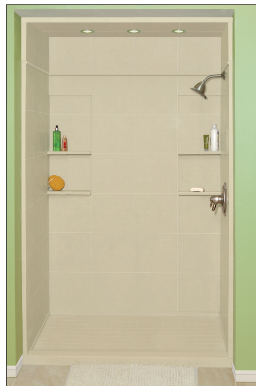
Shown with F6032R Shower Base, T6021 Dome Top